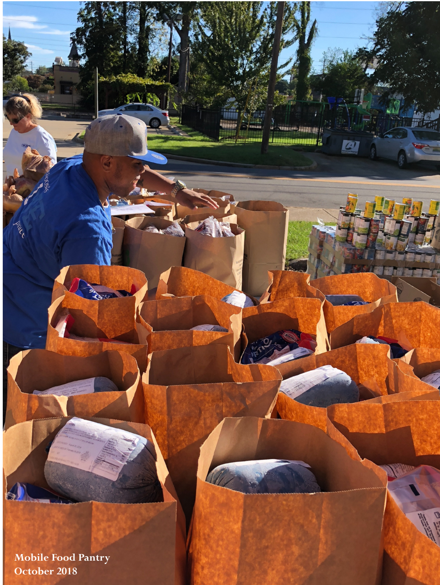
Mobile Food Pantry October 2018